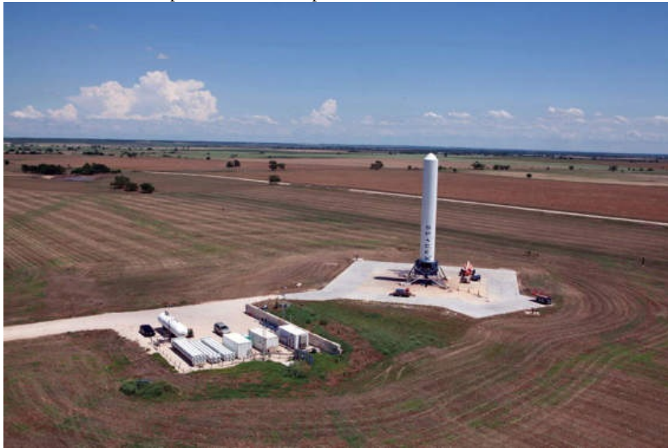
SpaceX tests new engines and crafts at a site in McGregor, Texas. Here the company is testing a reusable rocket, code-named “Grasshopper,” that can land itself.