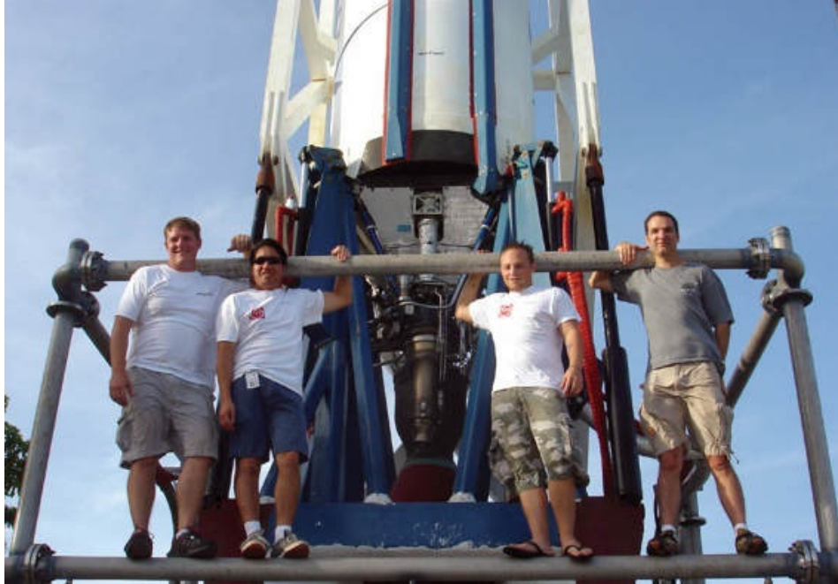
Tom Mueller ( far right, gray shirt ) led the design, testing, and construction of SpaceX's engines.