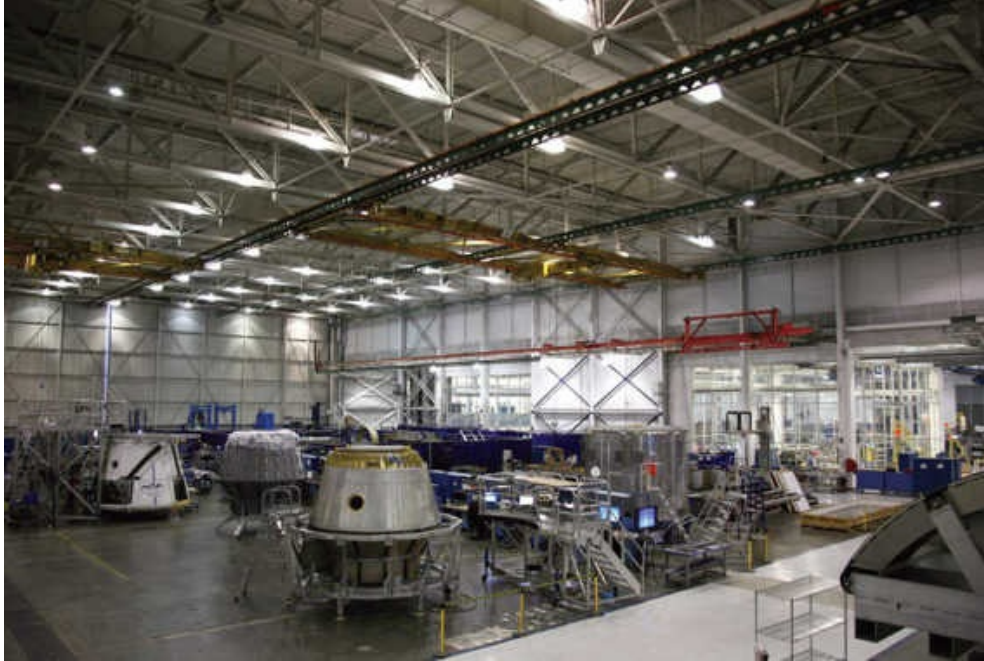
When SpaceX moved to a new factory in Hawthorne, California, it was able to scale out its assembly line and work on multiple rockets and capsules at the same time.