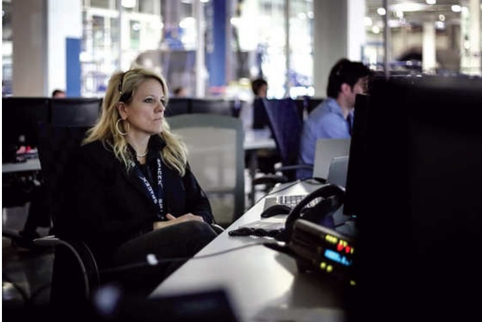
Gwynne Shotwell is Musk's right-hand woman at SpaceX and oversees the day-to-day operations of the company, including monitoring a launch from mission control.