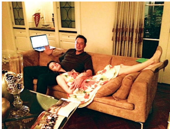
Musk and Riley relax at home in Los Angeles. Musk shares the home with his five young boys.