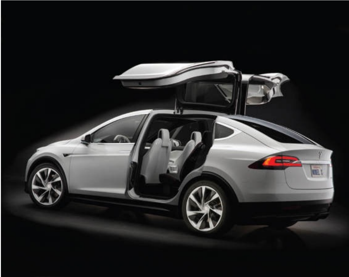
Tesla's next car will be the Model X SUV with its signature "falcon-wing doors."