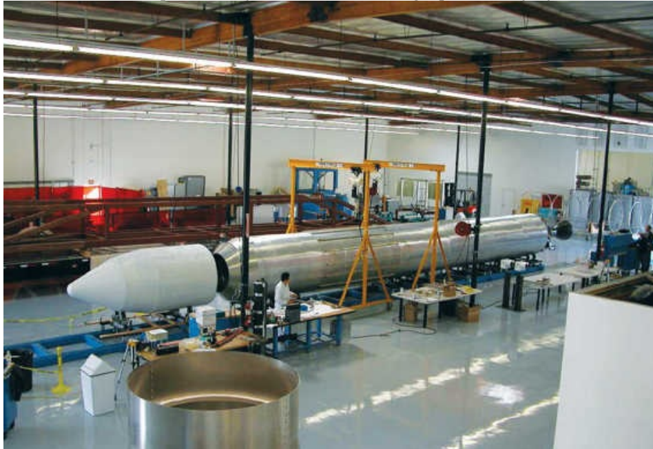
SpaceX built its rocket factory from the ground up in a Los Angeles warehouse to give birth to the Falcon 1 rocket.