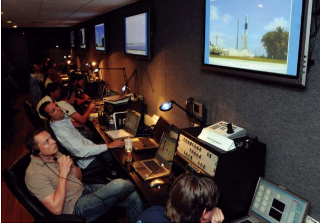
SpaceX built a mobile mission-control trailer, and Musk and Mueller used it to monitor the later launches from Kwaj.