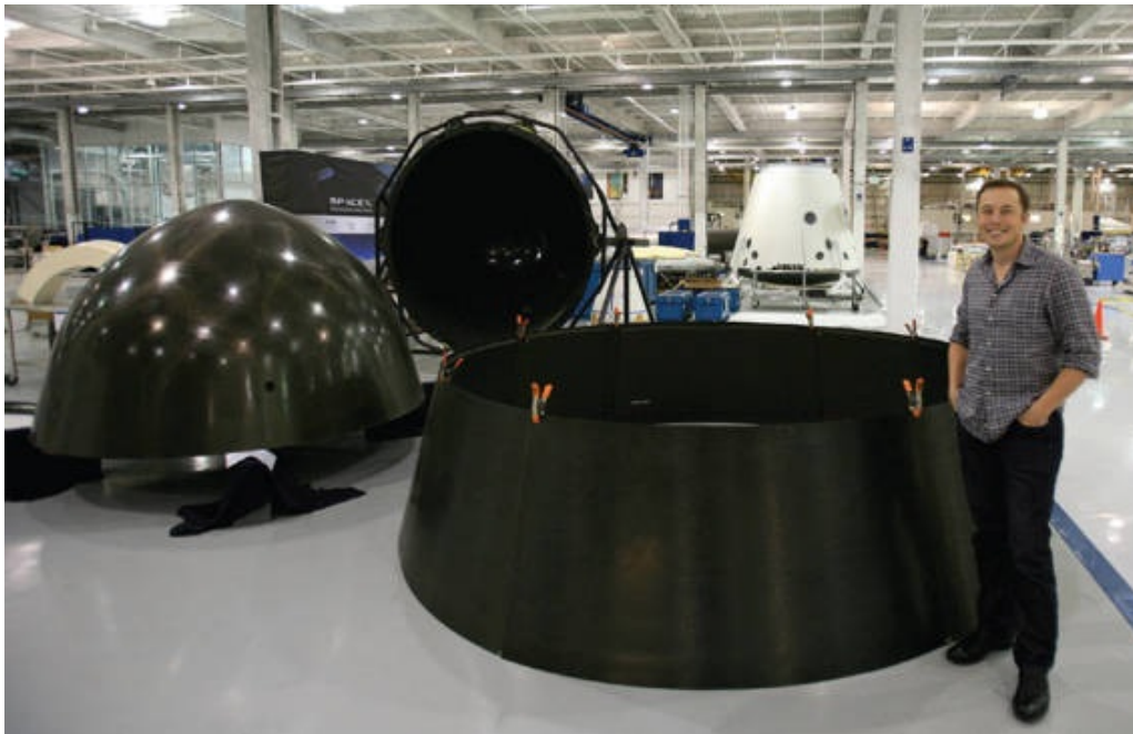
SpaceX's ambitions grew over the years to include the construction of the Dragon capsule, which could take people to the International Space Station and beyond.