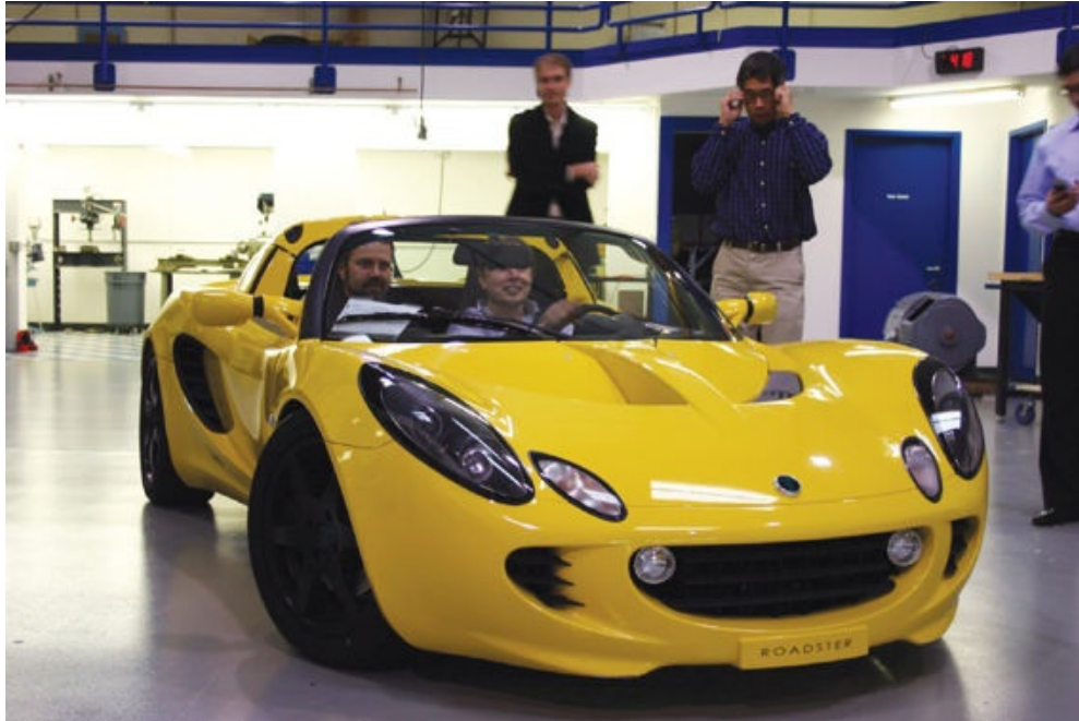
Musk and Martin Eberhard prepare to take the early Roadster for a test-drive. The relationship between the two men would fall apart in the years to come.