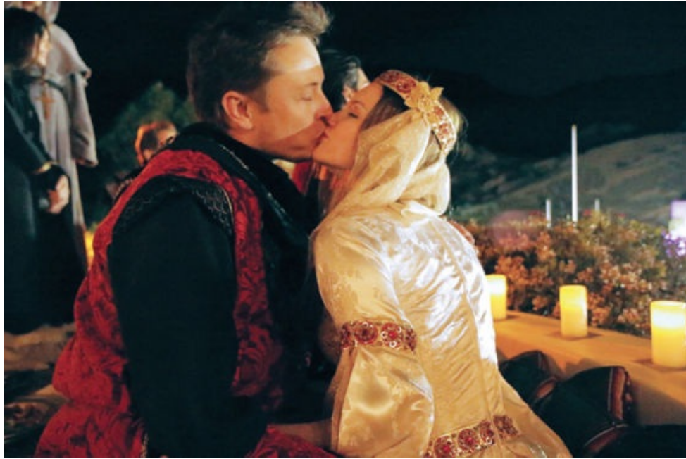
Musk married, divorced, remarried, and then divorced the actress Talulah Riley.