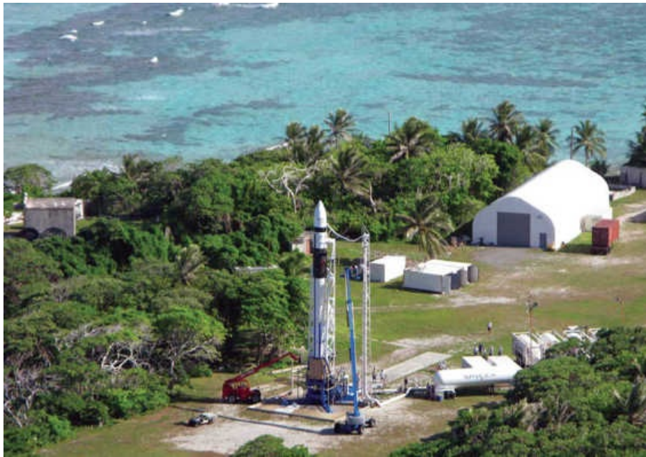
SpaceX had to conduct its first flights from Kwajalein Atoll (or Kwaj) in the Marshall Islands. The island experience was a difficult but ultimately fruitful adventure for the engineers.