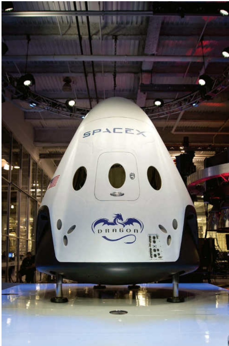
The Dragon V2 will be able to return to Earth and land with pinpoint accuracy.