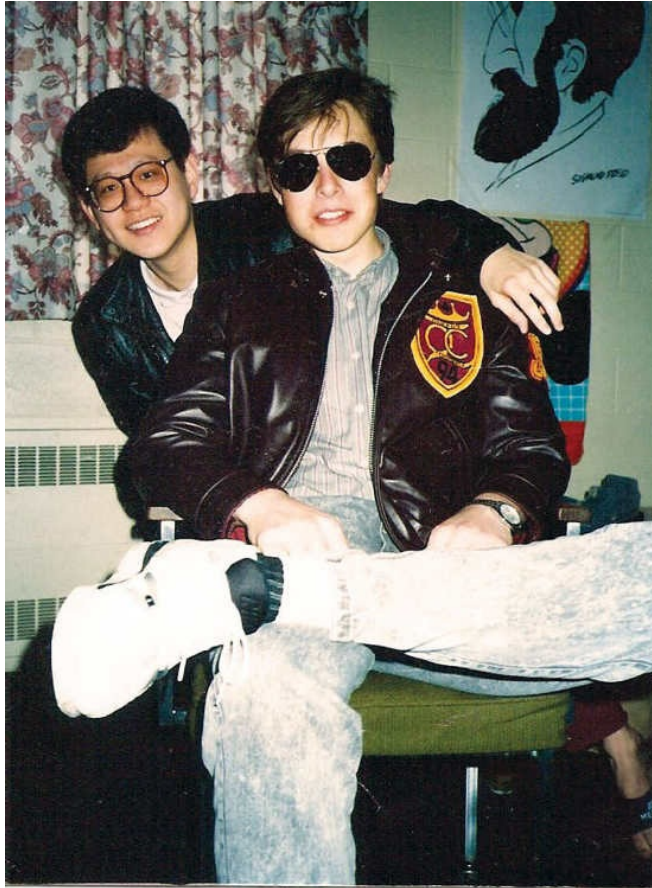
Musk ran away on his own to Canada and ended up at Queen's University in Ontario, living in a dormitory for foreign students.