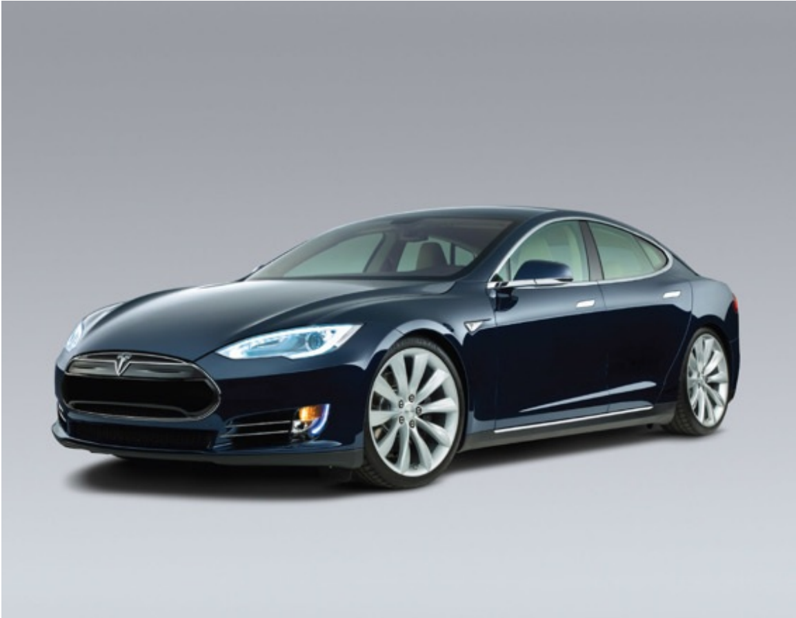
Tesla began shipping the Model S sedan in 2012. The car ended up winning most of the automotive industry's major awards.