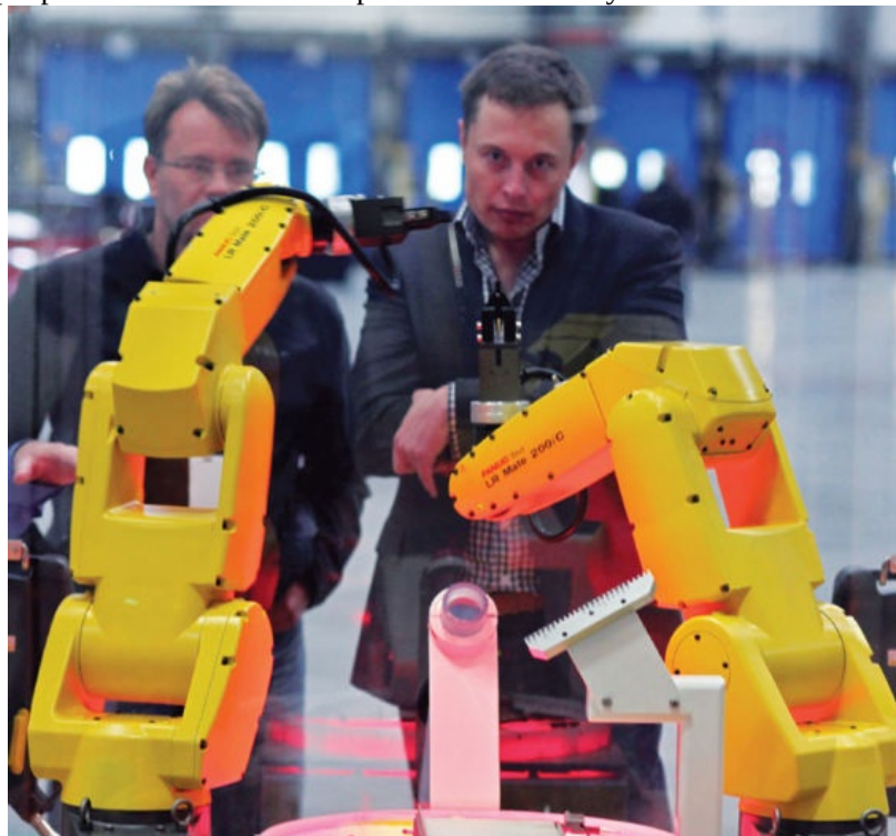
Musk has long had a thing for robots and is always evaluating new machines for both the SpaceX and Tesla factories.