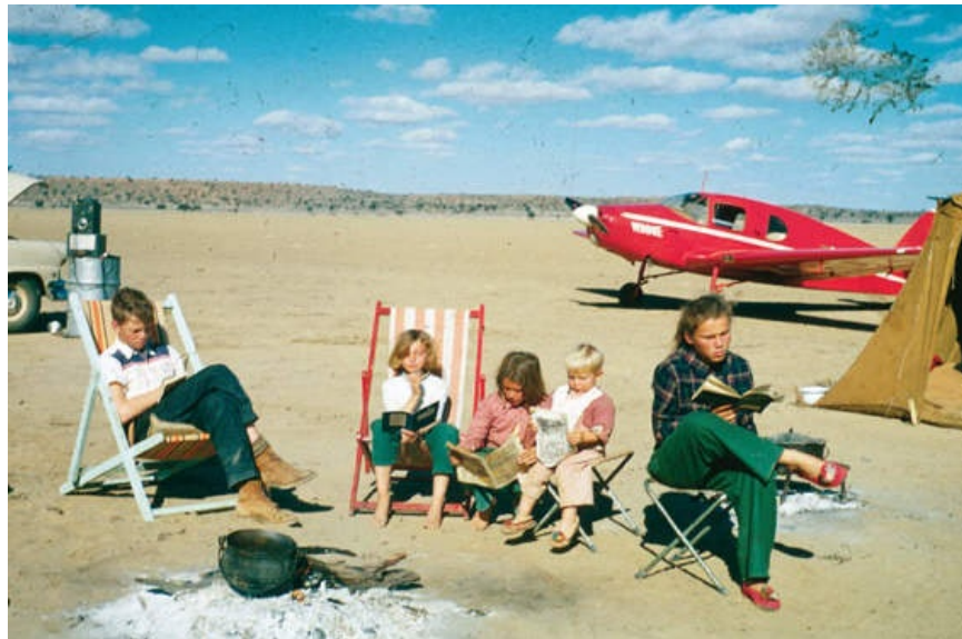
The Haldeman children had lots of downtime in the African bush while on wild adventures with their parents.