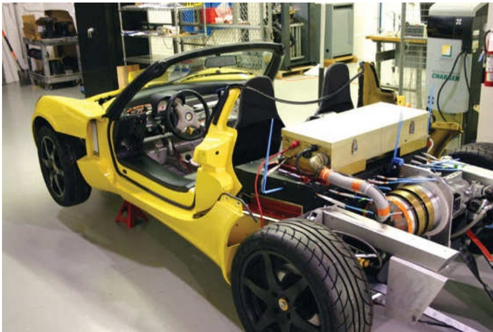
A handful of engineers built the first Tesla Roadster in a Silicon Valley warehouse that they had turned into a garage workshop and research lab.