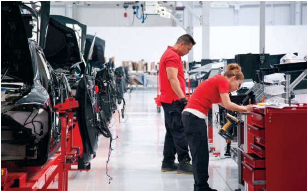
Tesla took over the New United Motor Manufacturing Inc. (or NUMMI) car factory in Fremont, California, which is where workers produce the Model S sedan.