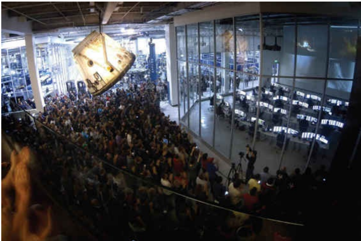
With a Dragon capsule hanging overhead, SpaceX employees peer into the company's mission control center at the Hawthorne factory.